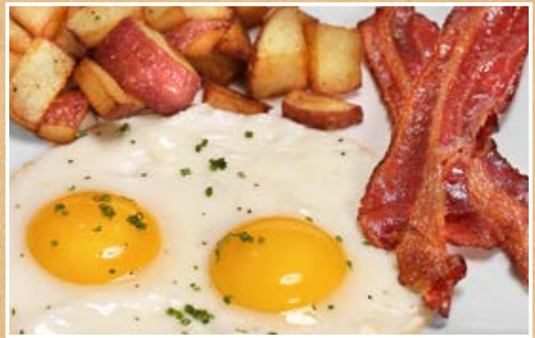
Eggs & Bacon