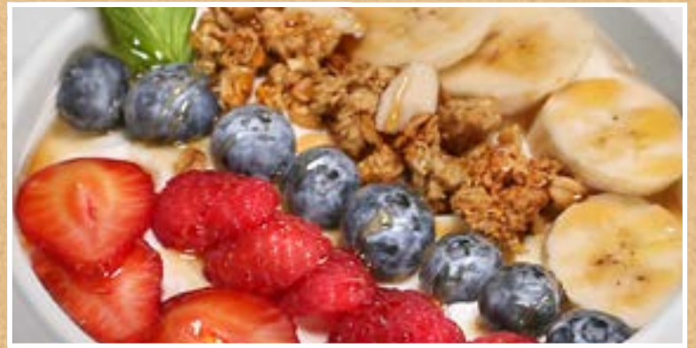
Berries & Granola