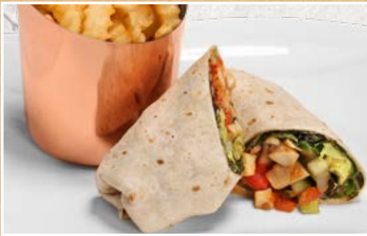
Chipotle Chicken Wrap