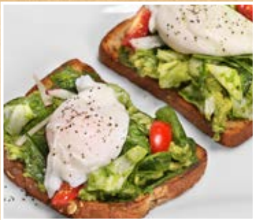
Avocado Toast & Poached Eggs