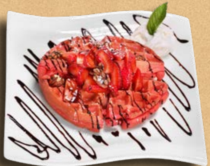
Red Velvet Waffle

Vanilla cream cheese, fresh strawberries, pecans, chocolate sauce