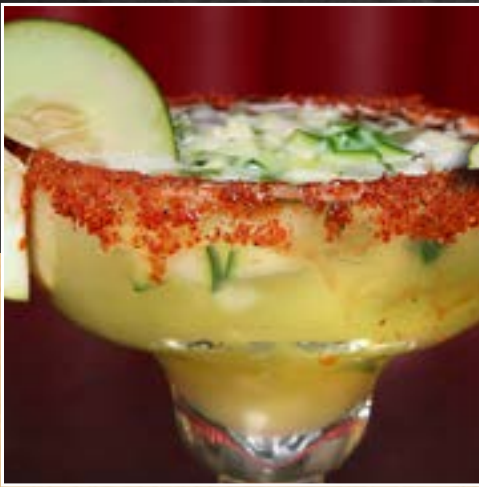
Spicy Cucumber Margarita