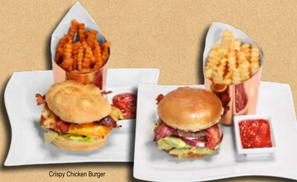
Crispy Chicken Burger

Wheat bread, mashed avocado, tomatoes, spinach, red onion, lettuce with honey mustard dressing